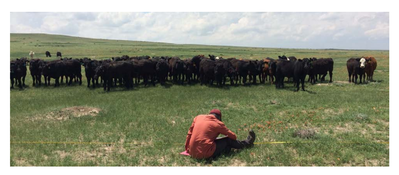
Precipitation is at 8.1" year-to-date and we've received 0.29" in June. Where did the rains go?

The move went smooth and the afternoon cool down has been nice break from the 90's we've been seeing lately. Even better news, the AGM vegetation early season sampling is complete , well done Veg Crew!